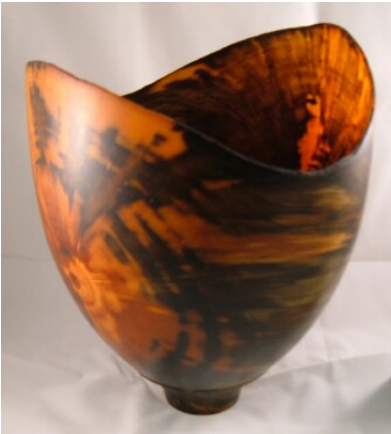
Bowl, Gerhard Schwenke, Norfolk Island Pine