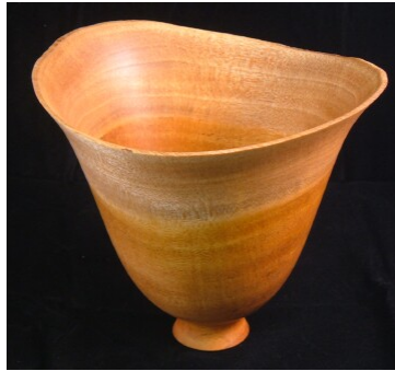
Bowl, Gerhard Schwenke, Mahogany