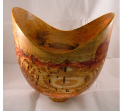
Bowl, Gerhard Schwenke, Box Elder