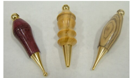
Light Pulls, Gerhard Schwenke, Various Woods