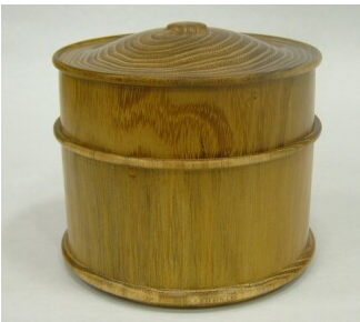
Box, Gerhard Schwenke, Black Locust