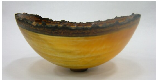
Bowls, Gerhard Schwenke, Norfolk Island Pine