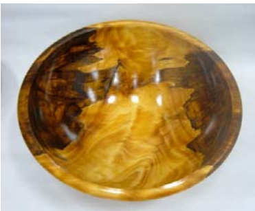
Left Bowl, Gerhard Schwenke, Norfolk Island Pine Right Balancing Toy