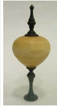
Box, Lilac / Ebonized Citrus ,Brian Rosencrantz