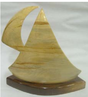
Sculpture, Norfolk Island Pine, Herb Cohen