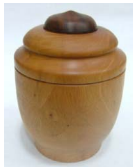
Box, Mahogany / Bubinga, Don Schwartz