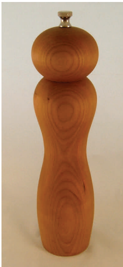
L: Pepper Mill, Nick Cook, Maple