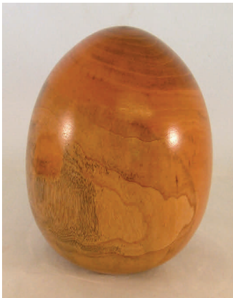
L: Ovoid, Lee Sky, Mahogany R: Lee Sky, Toothpick, Maple; Goblet, Banksia Pod, Ebony, Sapodilla; Watering Station, Rosewood