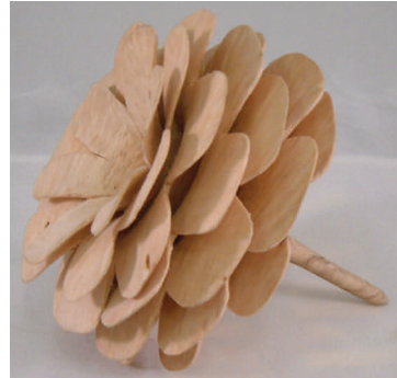
Clockwise From Above: Lee Sky, Tree Form; Saturn Box and Burl, Bottlebrush; Flower Form