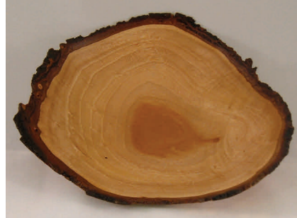
Clockwise From Above: Gerhard Schwenke, Natural Edge Bowl, Mahogany; Bowl, Rosewood; Lidded Vessel, Sea Grape; Doll's Table with Place Setting and Floral Arrangement