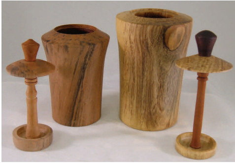
Clockwise From Above: Tim Rowe, Toothpick Holders; Tea Lights, Norfolk Island Pine