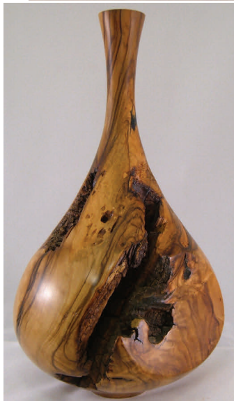
Left: Vase, Carl Schneider, Olive